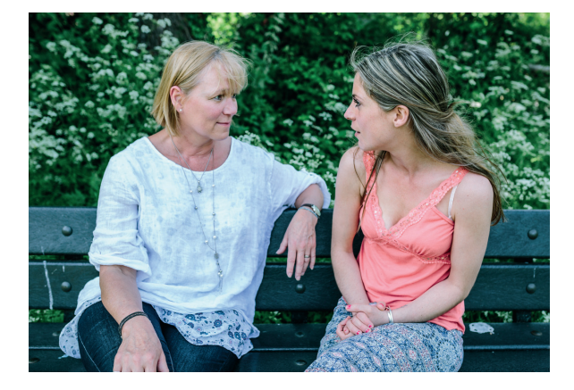
Top and above: Home-Start Elmbridge's trained volunteers help local families deal with whatever life throws at them

G Driven by the needs of the local community, the support of the Foundation is here for today and the long term