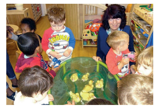
Above: Oasis Children's Centre provides essential support to children in need and their families across Elmbridge

Giving money is a great thing but giving it in an effective way is even more important