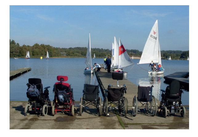
Above: Frensham Pond Sailability gives people with disabilities a new sense of freedom

66 I can visit the projects that money goes into, which has been extremely interesting and rewarding 77