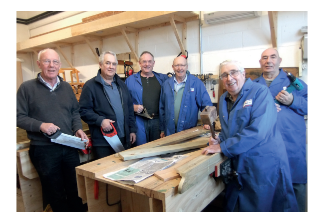
Above: Men in Sheds allows older men to socialise, make new friends and practise carpentry and other skills