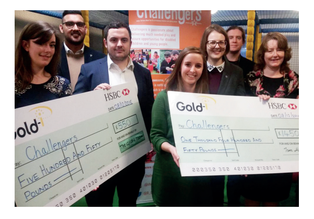
Above: Gold-i staff team presenting their recent support at Challengers' Guildford Play Centre

We understand there are problems everywhere, but it makes sense to work locally where we can have a direct effect on those near to us J